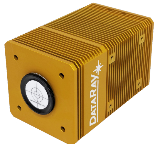
WinCamD-QD 2.40 x 2.40 x 3.42 in 61.0 x 61.0 x 86.8 mm