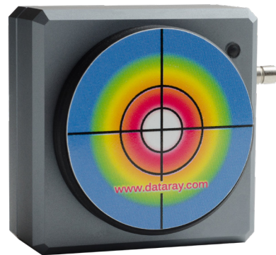
WinCamD-LCM 1.8 x 1.8 x 0.8 in 46 x 46 x 20 mm

The WinCamD-LCM is paired with DataRay's full-featured software which has no license fees, unlimited installations, and free software updates. It is ideal for applications including: CW and pulsed laser profiling; field servicing of laser systems; optical assembly; instrument alignment; beam wander and logging; R&D; OEM integration; quality control; and M^2 measurement with available M2DU stages.