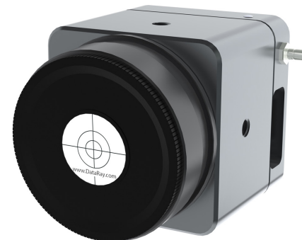
TaperCamD-LCM 2.25 x 2.25 x 2.13 in 57 x 57 x 54 mm

The TaperCamD-LCM is paired with DataRay's full-featured, highly customizable, user-centric software (which has no license fees, unlimited installations, and free software updates). It is perfect for applications including: CW and pulsed laser profiling; field servicing of laser systems; optical assembly; instrument alignment; beam wander and logging; R&D; OEM integration; and quality control.